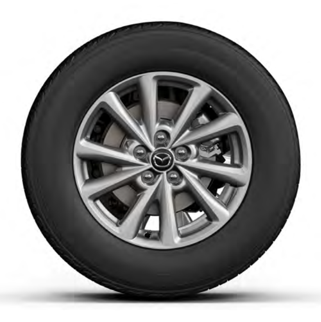
17" Metal Wheels (Silver Metallic)