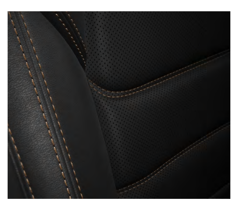
Black Leather with Grey Piping