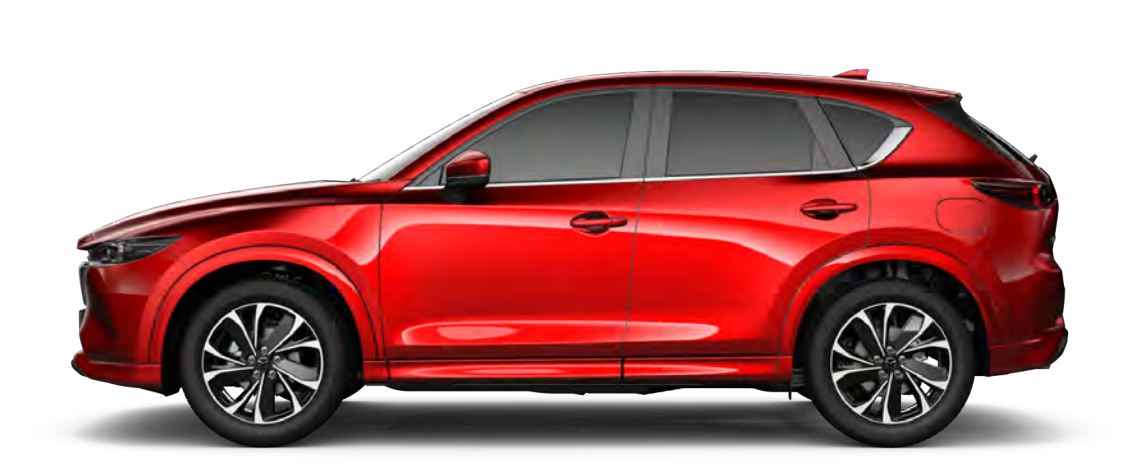
SOUL RED CRYSTAL