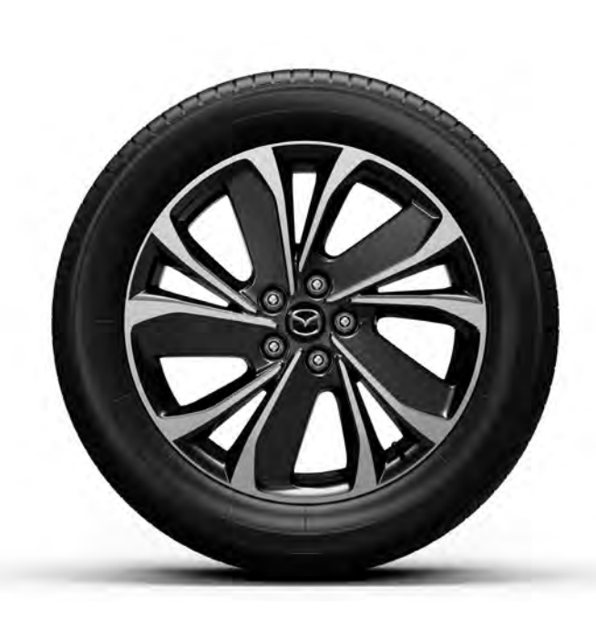
19" Aluminium Wheels (Black Metallic & Machining)