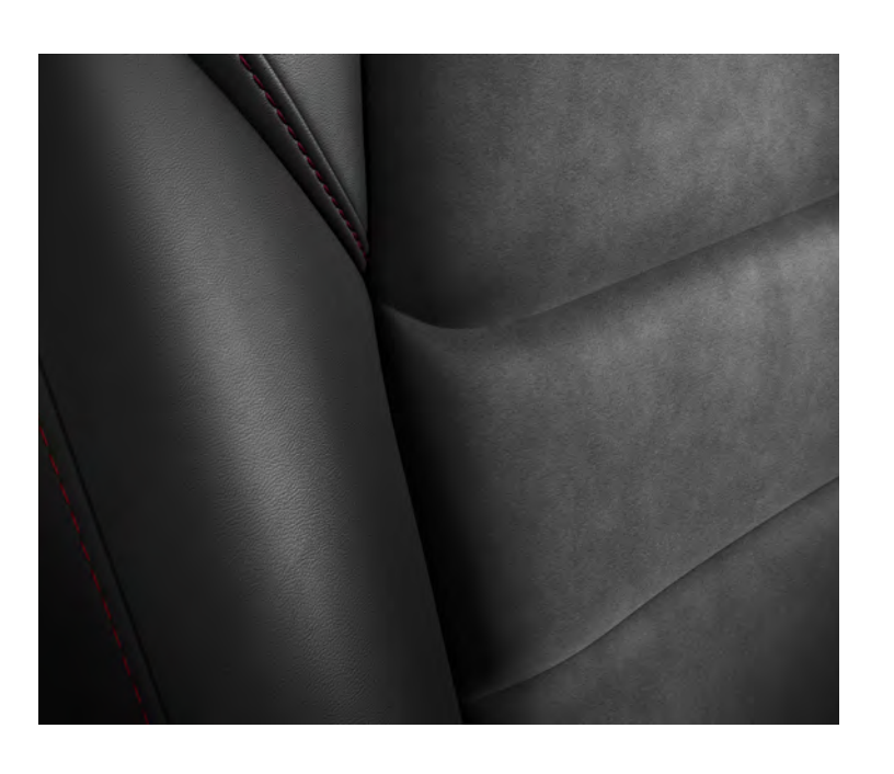
Black Leatherette & Suede Combination