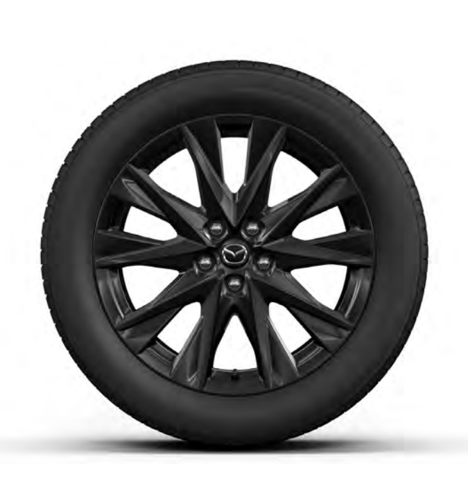
19" Alloy Wheels(Black Metallic)